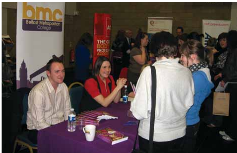
Careers Convention at Assumption

Activities offered at KS3 are: dance, gymnastics, netball, camogie, swimming, athletics, cross-country, health related PE, minor games and tennis.