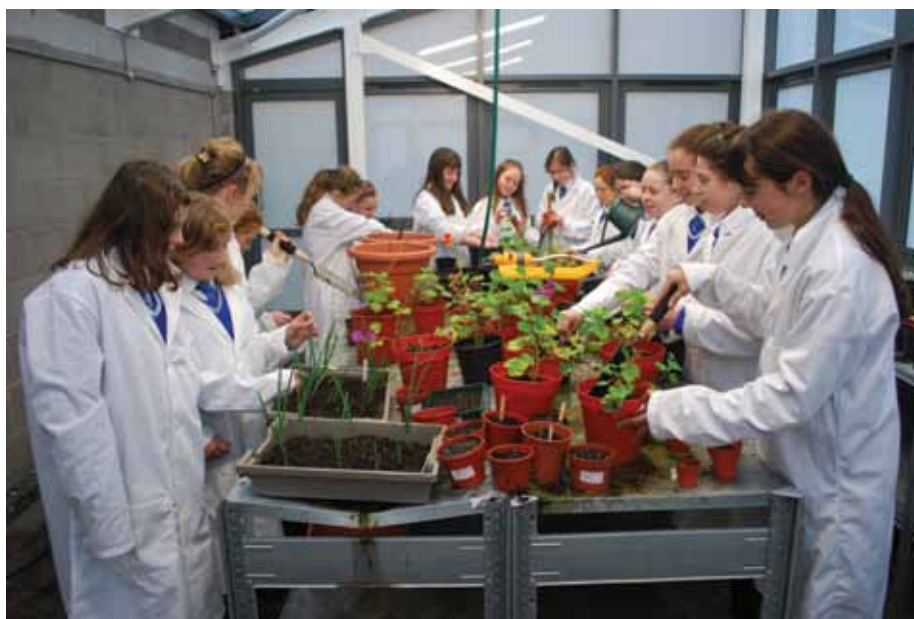
Science Club in our Greenhouse